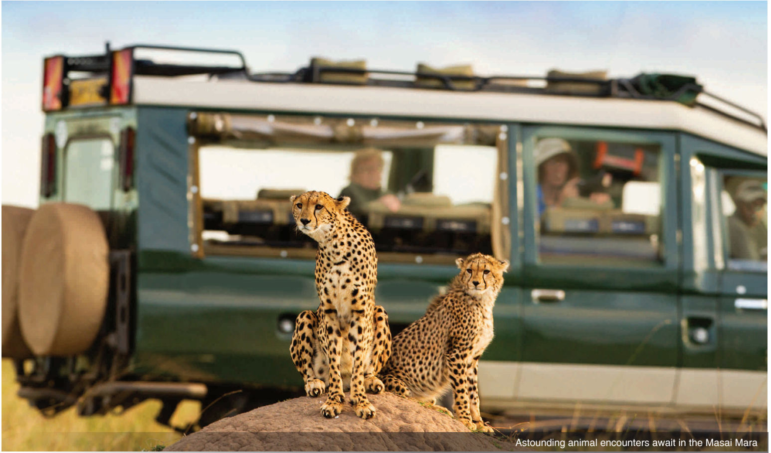
Astounding animal encounters await in the Masai Mara