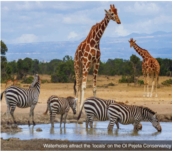
Waterholes attract the 'locals' on the OI Pejeta Conservancy