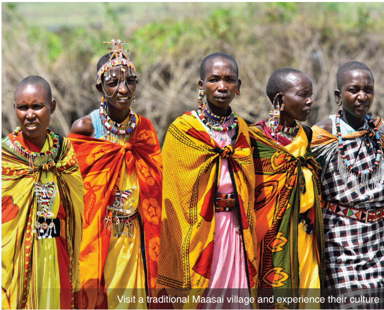
Visit a traditional Maasai village and experience their culture

Rift Valley. Relish in the surrounding sights and sounds of the native wildlife. Beautiful birds along the banks, in the trees, and soaring above; lazy hippos yawning as they emerge from the water; African Fish Eagles swoop down to snatch a fish from the lake for dinner...it all awaits! Check in to the lodge and enjoy a relaxing evening. Meals: B, L, D