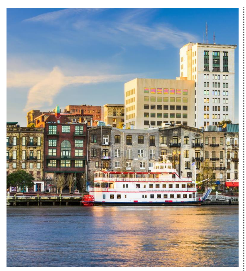
7 Days • 10 Meals: 6 Breakfasts, 4 Dinners

HIGHLIGHTS... Historic Charleston, Choice on Tour: Walking Tour or Fort Sumter Cruise in Charleston, Boone Hall Plantation & Gardens, Savannah, St. Simons Island, Jekyll Island, Sea Turtle Hospital