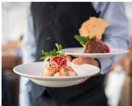
Gourmet Food crafted by Signature Chefs