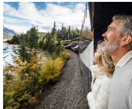
Exclusive Outdoor Viewing Platform