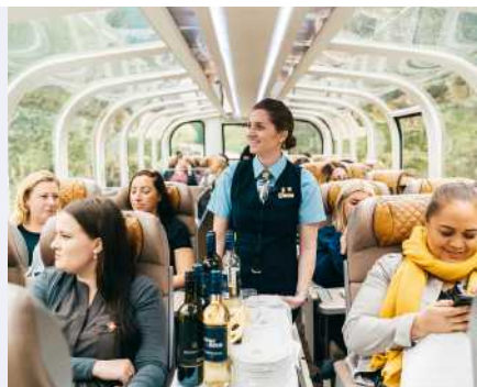
Complimentary Wine & Cheese